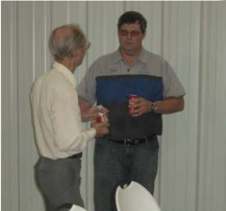
A member and a guest of the Houston Section consider the possibilities of having a large climate controlled space at their disposal.