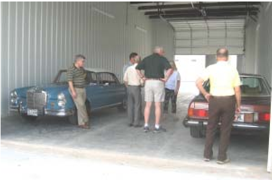
Our hosts put out a very nice mid-morning snack selection for the group in one of their air conditioned garage units.

In addition to the recently completed facility on Louetta Road just off of State Highway 249 that we visited this month, GarageTown Texas has plans to build similarly sized projects in The Woodlands, Sugar Land and in the Clear Lake area near Ellington Field. Based on the apparent success of this concept this author believes that other developers will follow GarageTown's lead in this type of real estate product. If you store anything of value for an extended period of time garage condominiums might be of interest to you .