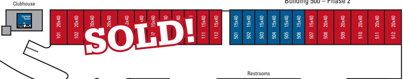
Building 500 – Phase 2

Pricing on pre-completion & early closing available.